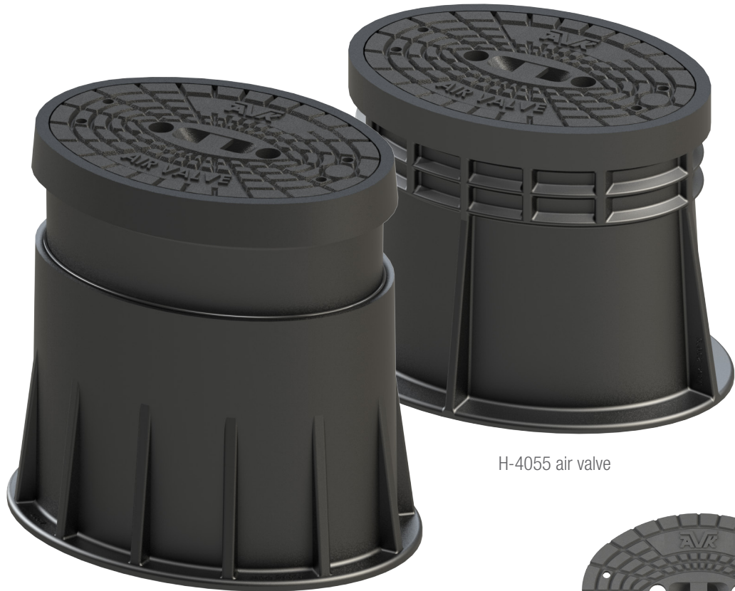
H-4055 air valve

AVK Plastics introduces a surface box specially made for air valves. Due to clever design features the H-4055 air valve allows an optimal admittance and discharge of air. The H-4055 air valve is suitable for water or waste water distribution applications and is available as fixed or height adjustable version.