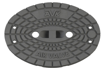
Top view lid